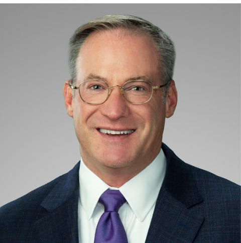
Hon. Beau A. Miller, At-Large Position 2 (2024–2026)